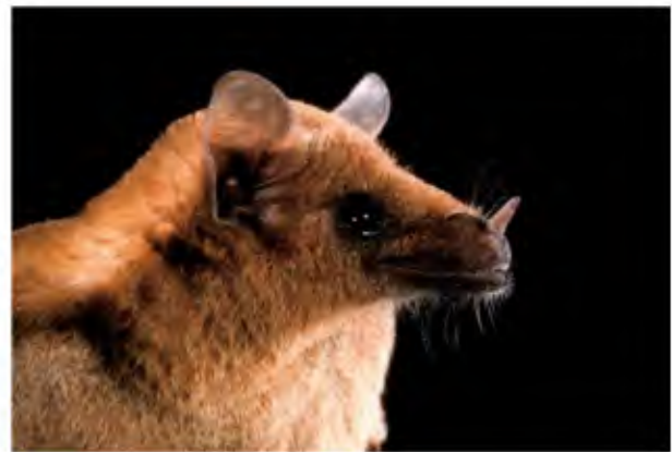
FIG. 1. Photograph of an adult female Leptonycteris yerbabuena from Mexico.

Leptonycteris yerbabuena migrates into northern Sonora and southern Arizona along 2 migration routes (Wilkinson and Fleming 1996). Lesser long-nosed bats arriving in coastal Sonora and southwestern Arizona during the spring migration travel along the western coast of Mexico. Lesser long-nosed bats arriving later in the summer to sites in south-central and southeastern Arizona and southwestern New Mexico fly along the foothills of the Sierra Madre Mountains. Migrants may travel from as far south as Jalisco (1,000–1,600 km—Wilkinson and Fleming 1996).