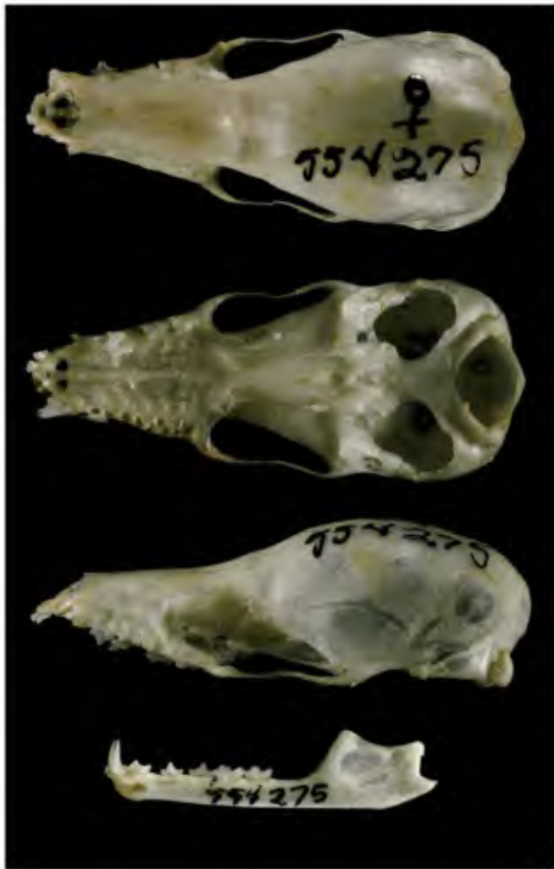
FIG. 2. Dorsal, ventral, and lateral views of cranium and lateral view of mandible of an adult male Leptonycteris yerbabuena (U.S. National Museum of Natural History [USNM] 554275) from Cochise County, Arizona. Greatest skull length is 25.9 mm.

FOSSIL RECORD. Late Pleistocene fossils are known from Cueva de La Presita, San Luis Potosí (= L. curasoae —Arroyo-Cabrala 1992; Arroyo-Cabrala and Polaco 2003). This locality is 21.4 km S of Matehuala, San Luis Potosí (23°29'37"N, 100°37'16"W) at an elevation of 1,540 m.