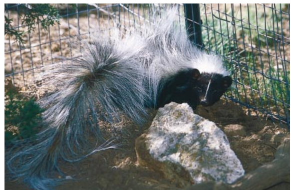
FIG. 1. Adult male Mephitis macroura .

ECOLOGY. The hooded skunk is most common in the arid lowlands (Davis and Russell 1954), but also occurs in deciduous