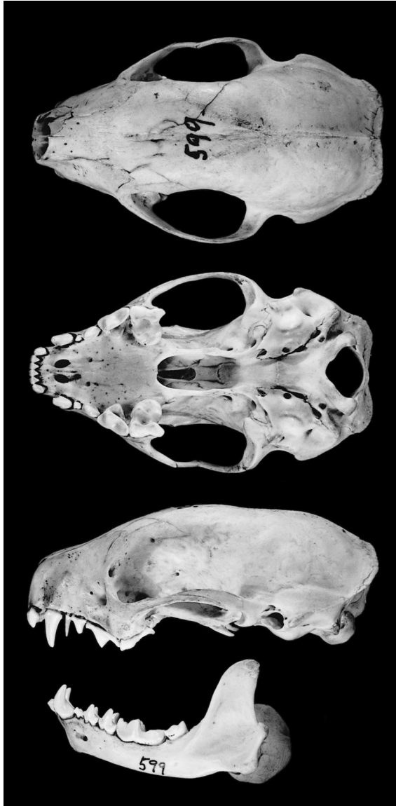
FIG. 2. Dorsal, ventral, and lateral views of cranium and lateral view of mandible of Mephitis macroura from Pinal County, Arizona (juvenile female, American Museum of Natural History, specimen #599/1354). Greatest length of cranium is 63.5 mm.

or ponderosa forest, forest edges, pastures, rocky canyons, and riparian habitats (Baker 1956; Findley et al. 1975; Janzen and Hallwachs 1982). In Mexico, hooded skunks occupy home ranges of 2.8–5.0 km 2 (Ceballos and Miranda 1986). Typically, M. macroura occurs from sea level to 2,440 m (Hubbard 1972), but 1 animal was collected in the Boreal Forest of Morelos, Mexico, at 3,110 m (Davis and Russell 1954), and in Arizona, they occur at 2,620 m along Hannagan Creek and at Beaverhead Lodge in Greenlee County (Hoffmeister 1986). In Guerrero, Mexico, hooded skunks are widespread but scattered below 1,830 m (Davis and Lukens 1958).