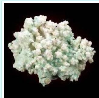
Aragonite Daylight Mine, Daylight-Narragansett Mines, Rosemont, Helvetia-Rosemont District, Santa Rita Mts, Pima Co., Arizona, USA

Workings include tunnels and shafts. Averaged 7.01% Cu. Yielded 13,248 tons (1,611,429 lbs.) Cu (1917). 1870-1961 Average 4% Cu, 0.5 Oz/ton Ag 90000 tons.